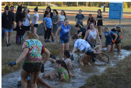
Seniors take on Frosh in Mud Tug.