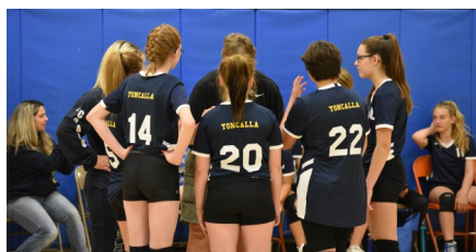
The middle school volleyball players confer at the Sutherland Tournament.