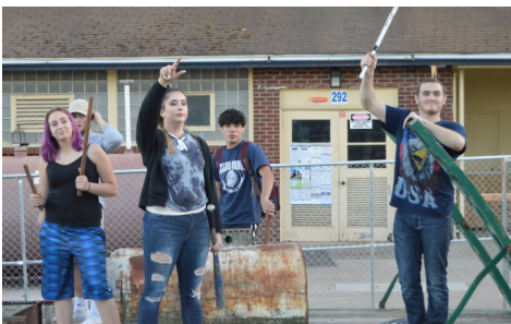
Seniors prep for the Noise Parade.