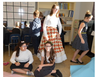
7th graders decorate their room