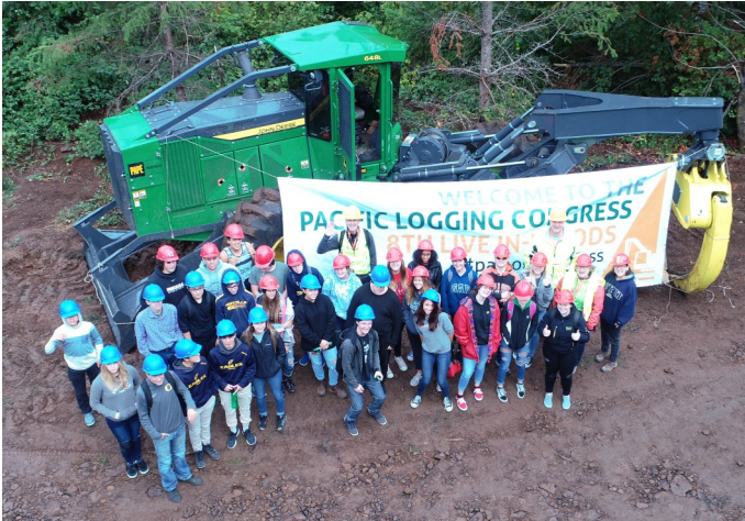
The Natural Resources classes visited the Pacific Logging Congress Live in the Woods Show. This is a picture taken from a drone they had on site.