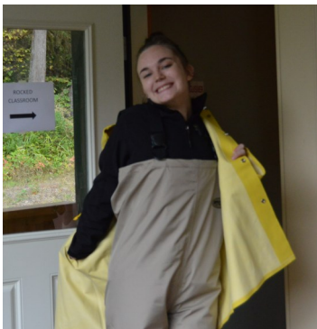
Savannah models the proper gear for spawning