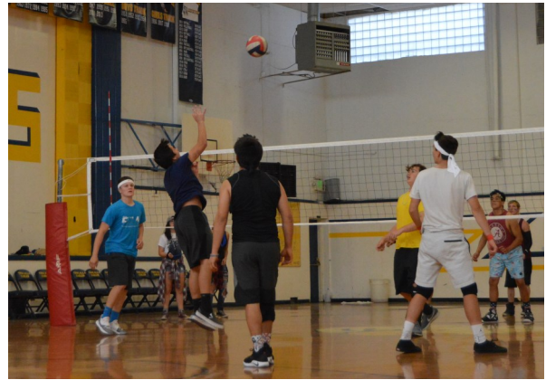
Sophomores take on the Juniors in Stud Volleyball.