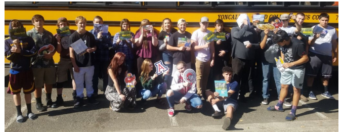
Students attended the college fair at RHS