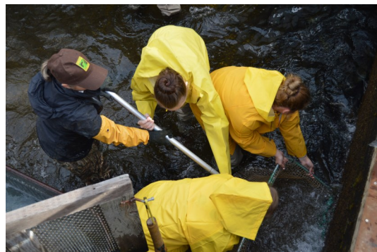
Catching fish to spawn.